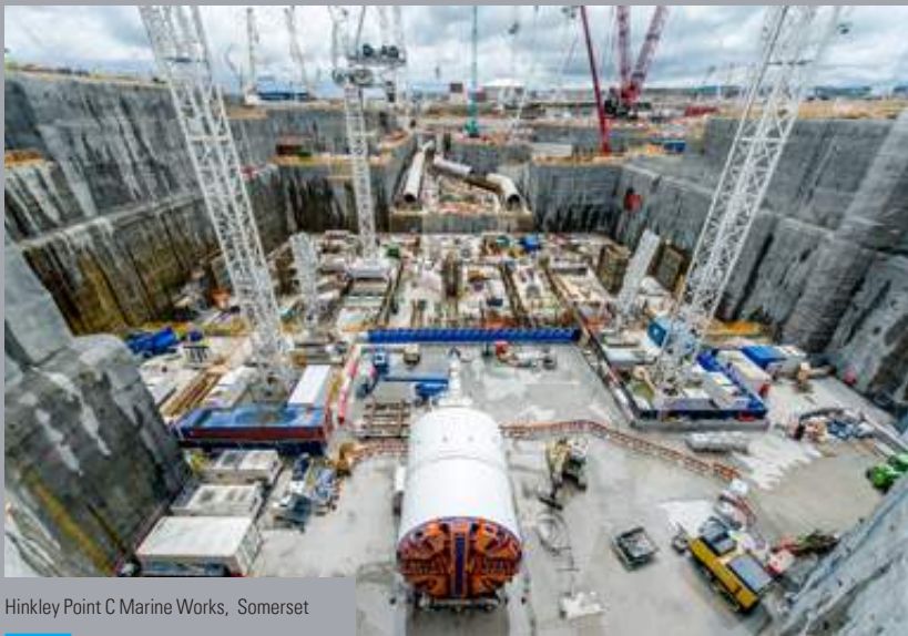
Hinkley Point C Marine Works, Somerset