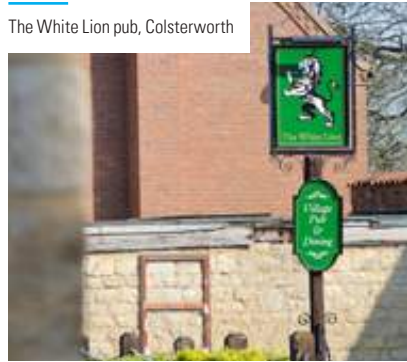
The White Lion pub, Colsterworth