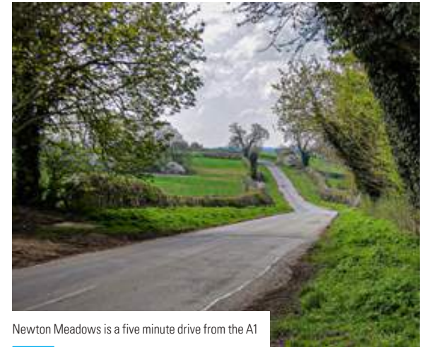
Newton Meadows is a five minute drive from the A1