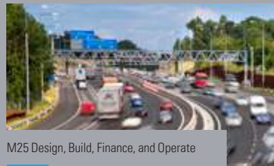
M25 Design, Build, Finance, and Operate