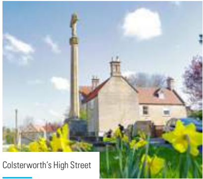
Colsterworth's High Street