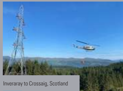
Inveraray to Crossaig, Scotland