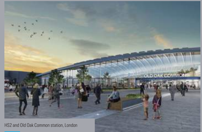
HS2 and Old Oak Common station, London