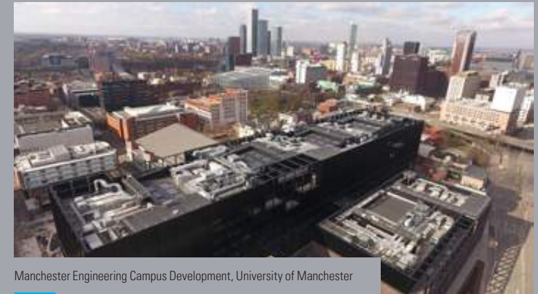
Manchester Engineering Campus Development, University of Manchester