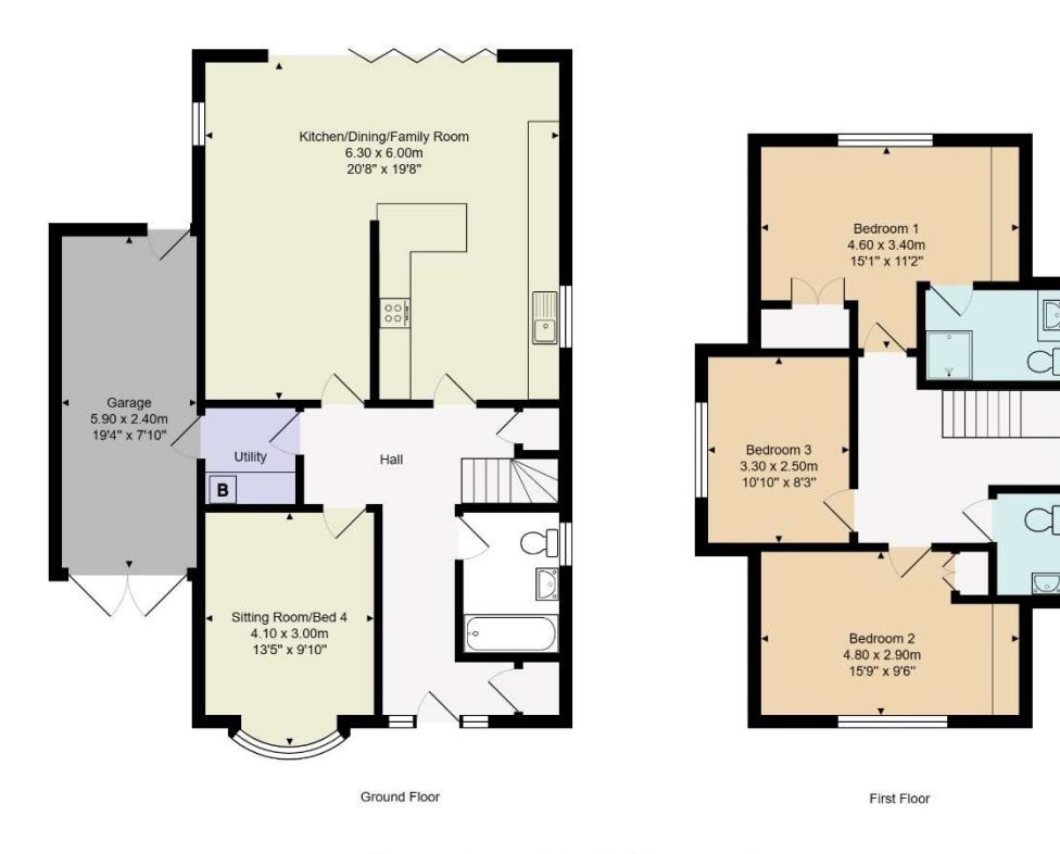
All measurements are approximate and for display purposes only.