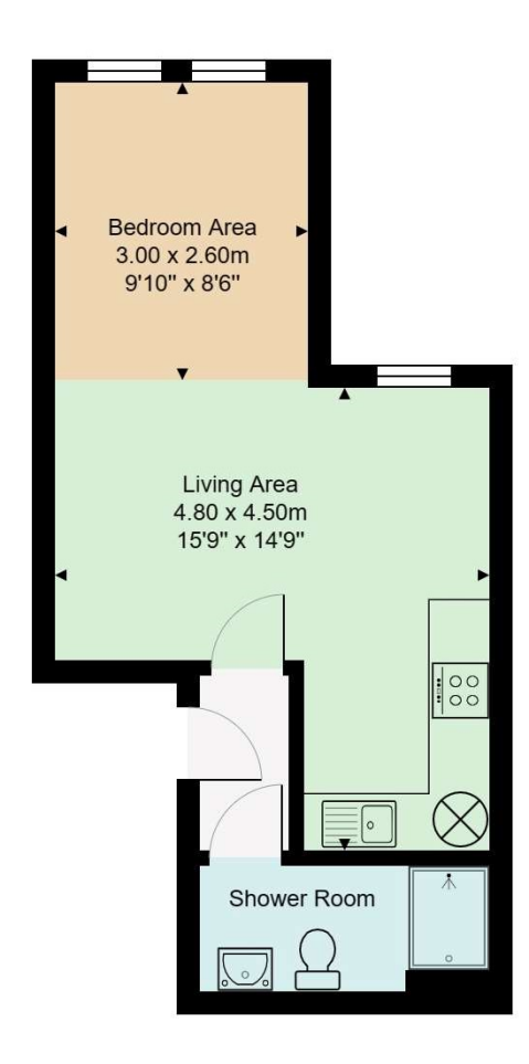
Total Area: 31.3 m² ... 337 ft² All measurements are approximate and for display purposes only.