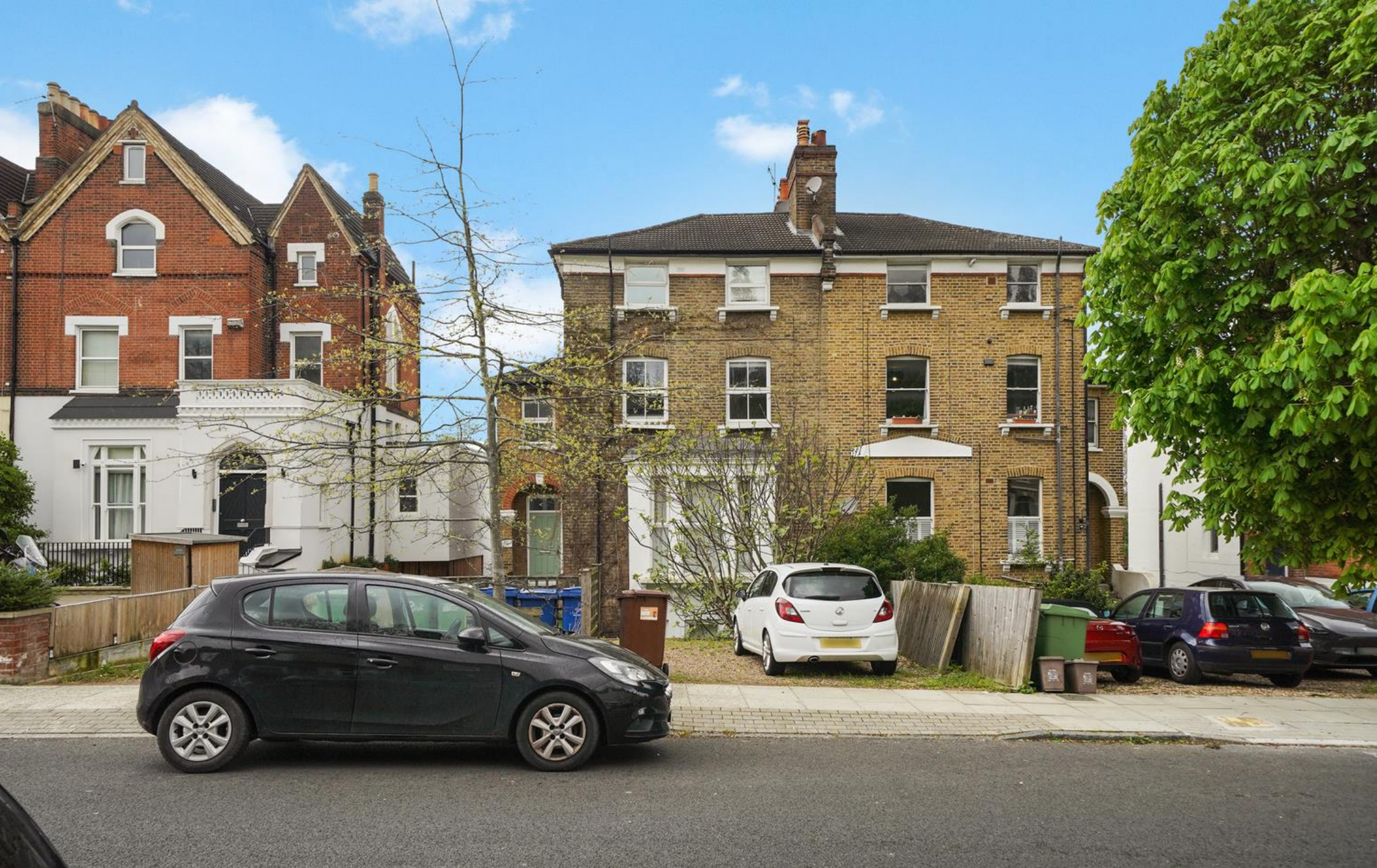
Wood Vale, Forest Hill, London