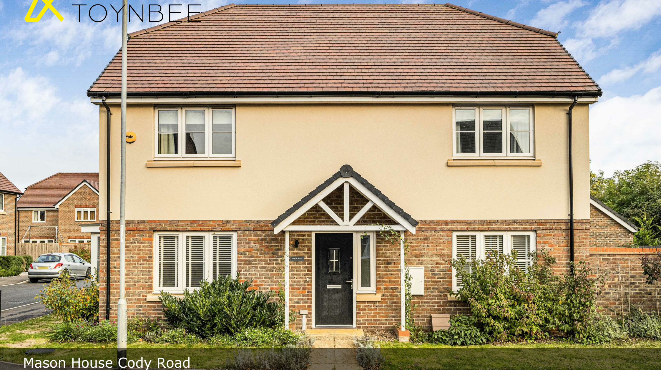
Mason House Cody Road Waterbeach, CB25 9LS