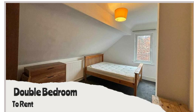
Double Bedroom To Rent