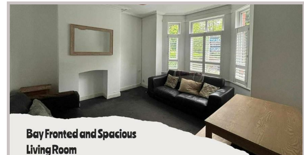
Bay Fronted and Spacious Living Room