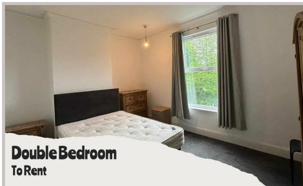
Double Bedroom To Rent