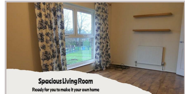
Spacious Living Room Ready for you to make it your own home