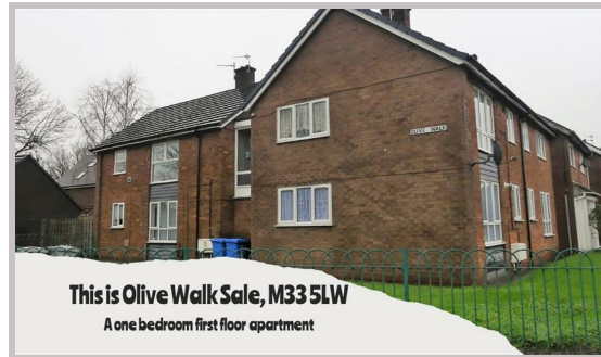
This is Olive Walk Sale, M33 5LW A one bedroom first floor apartment