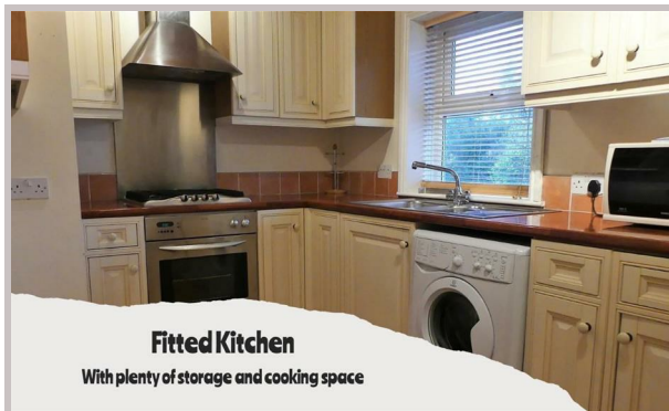
Fitted Kitchen With plenty of storage and cooking space