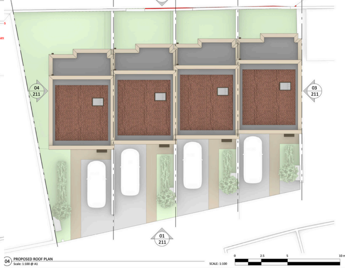
04 PROPOSED ROOF PLAN Scale: 1:100 @ A1