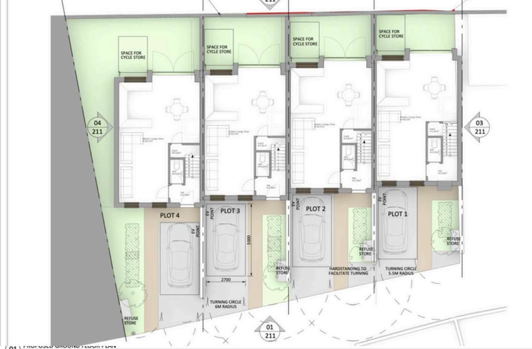
01 PROPOSED GROUND FLOOR PLAN Scale: 1:100 @ A1