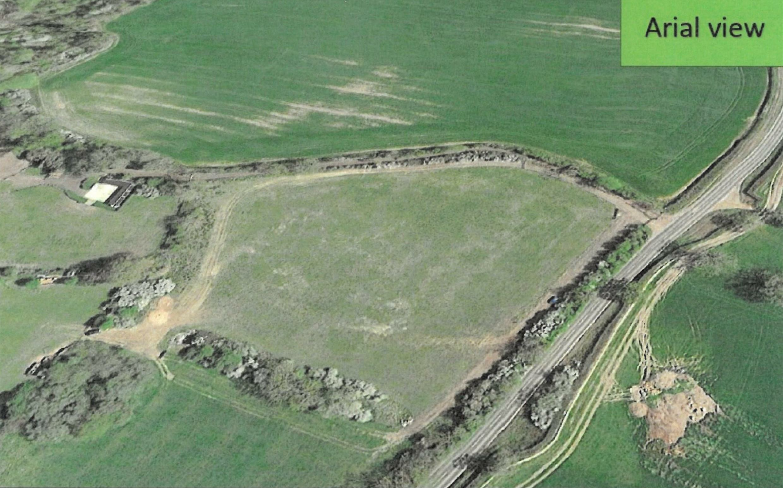
Land on Hawkshead Road, Brookmans Park EN6 1NL