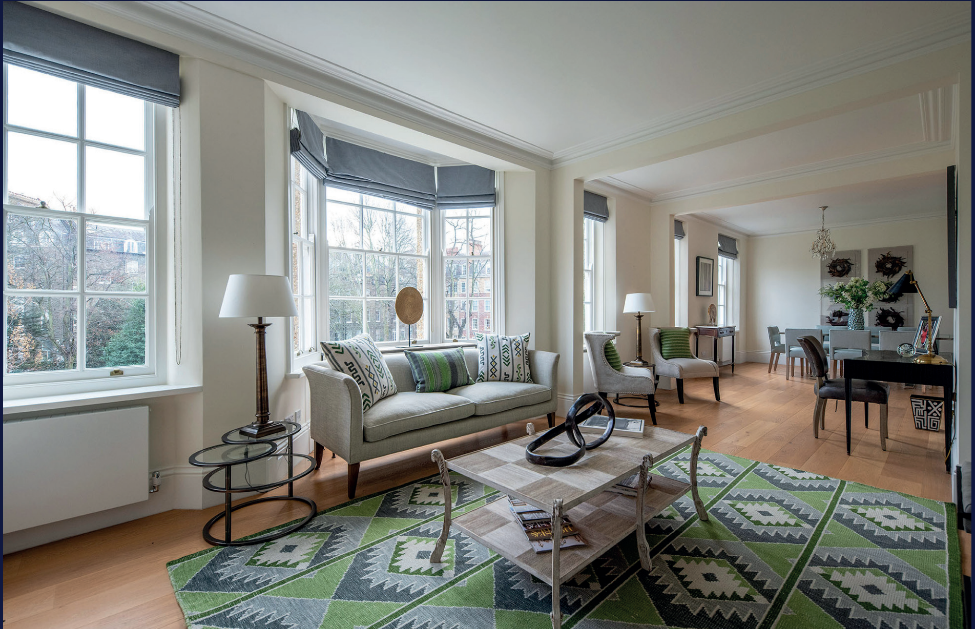
Coleherne Court, SW5