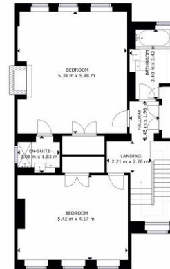
GROSS INTERNAL AREA GROUND FLOOR: 87.05 m 2 ; SECOND FLOOR: 86.34 m 2 ; THIRD FLOOR: 60.09 m 2 REDUCED HEADROOM BELOW 2.04: 5.07 m 2 TOTAL: 233.48 m 2 SMALL AND DIMENSIONAL INFORMATION: ACTUAL AREA VARY