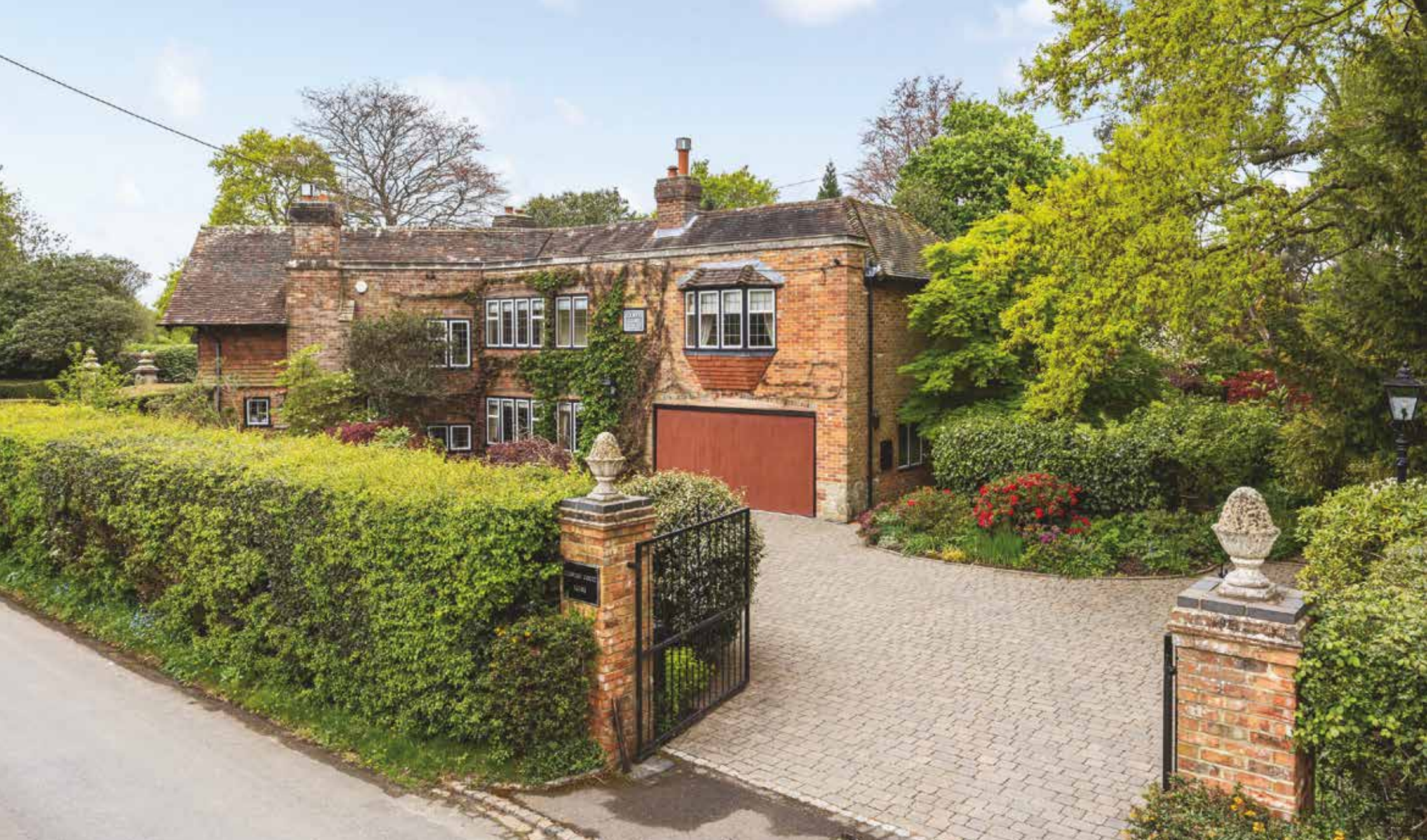
Colwood Court Lodge Colwood Lane | Warninglid | Haywards Heath | RH17 5UQ