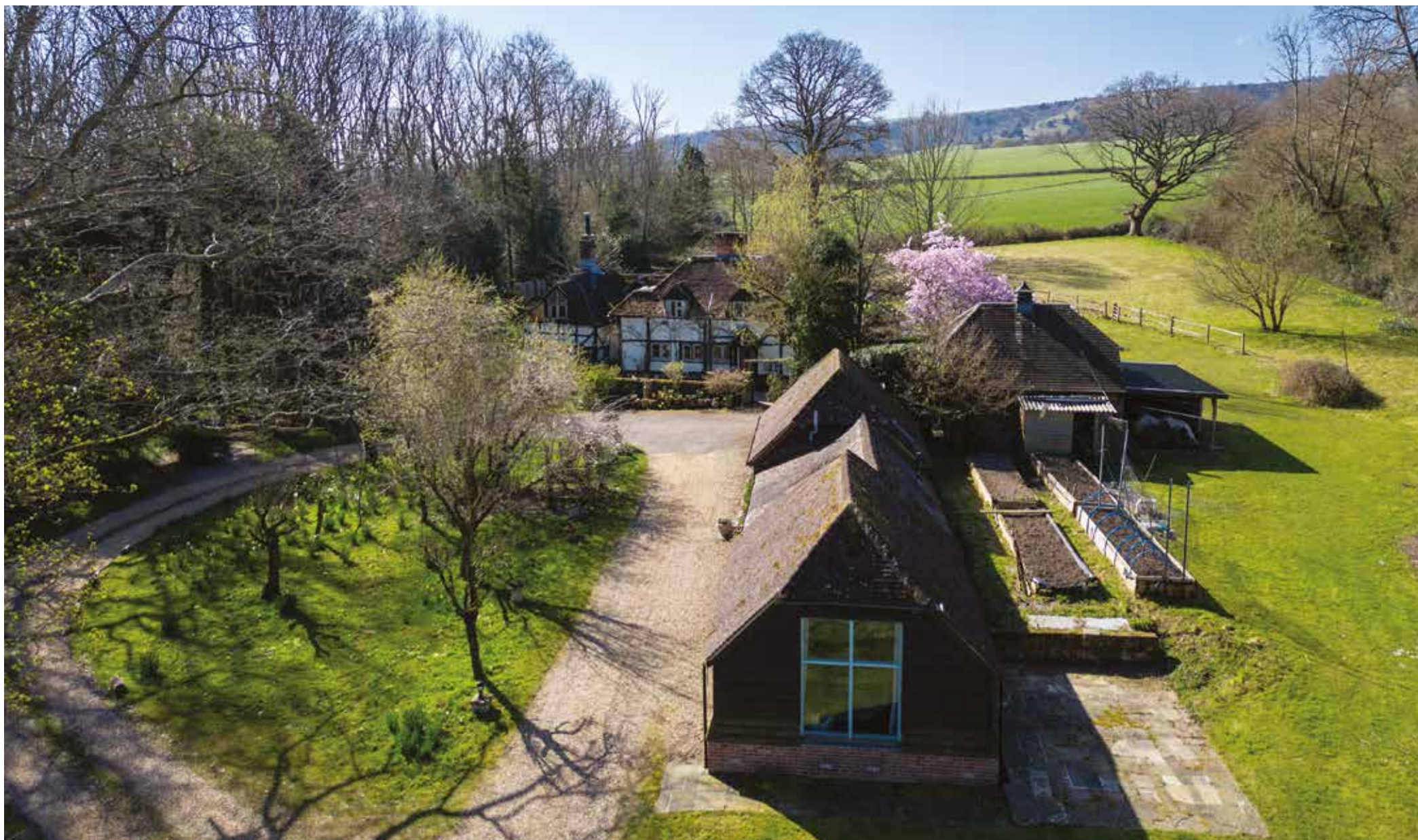
Cooks Copse Hale Hill | Westburton | Pulborough | West Sussex | RH20 1HE