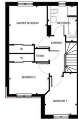
First Floor Plan Layout Scale 1:100