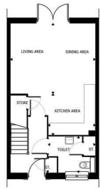
Ground Floor Plan Layout Scale 1:100