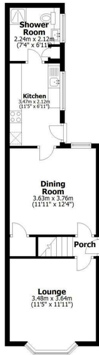
Ground Floor Approx. 42.8 sq. metres (460.3 sq. feet)