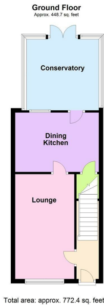
Total area: approx. 772.4 sq. feet