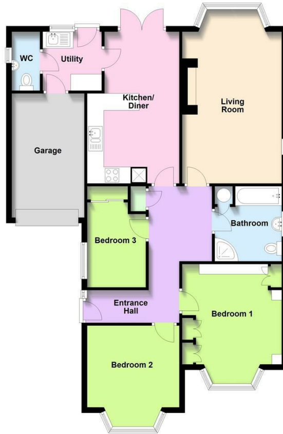
Total area: approx. 107.6 sq. metres (1158.7 sq. feet)