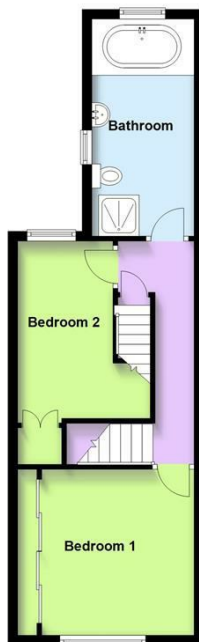
First Floor Approx. 39.7 sq. metres (426.9 sq. feet)