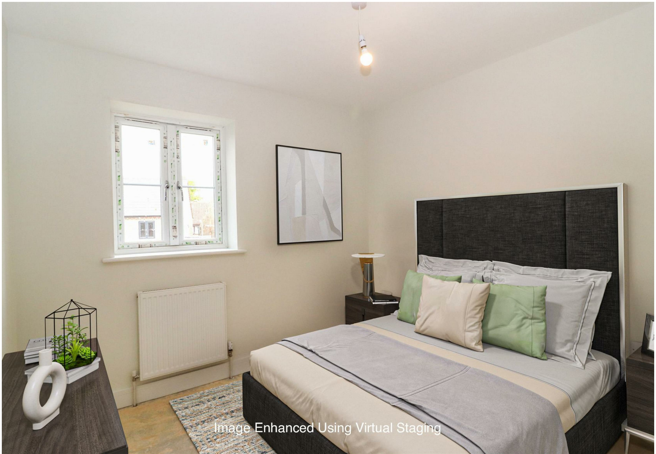
Image Enhanced Using Virtual Staging