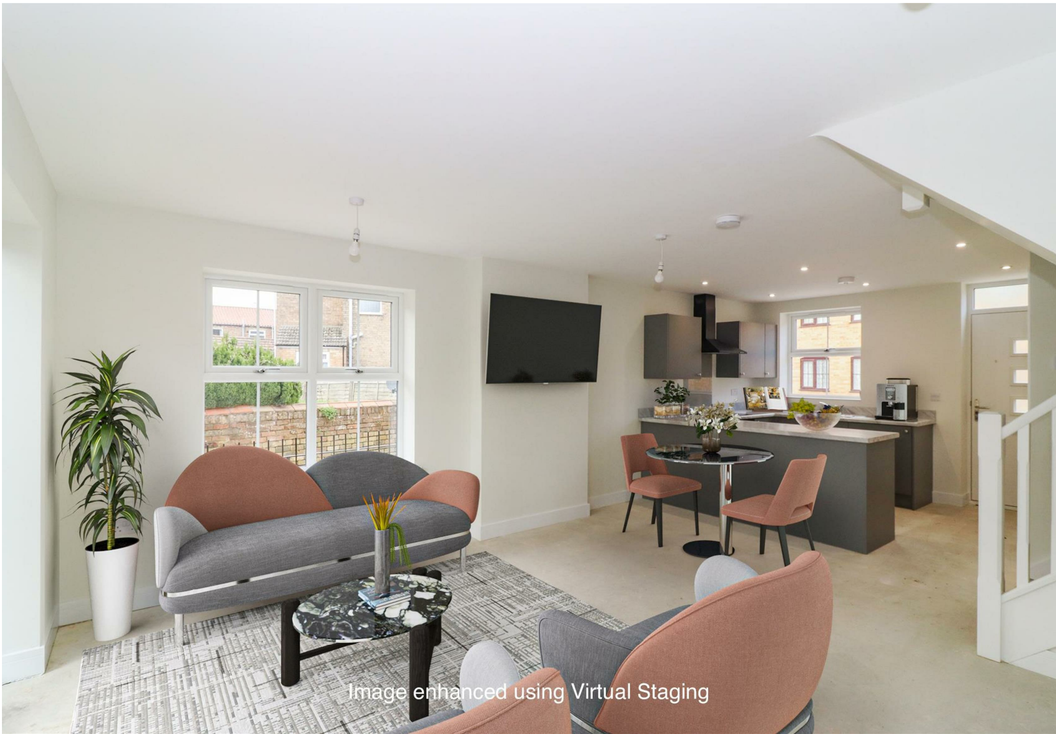
Image enhanced using Virtual Staging