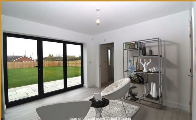
Image enhanced using Virtual Staging