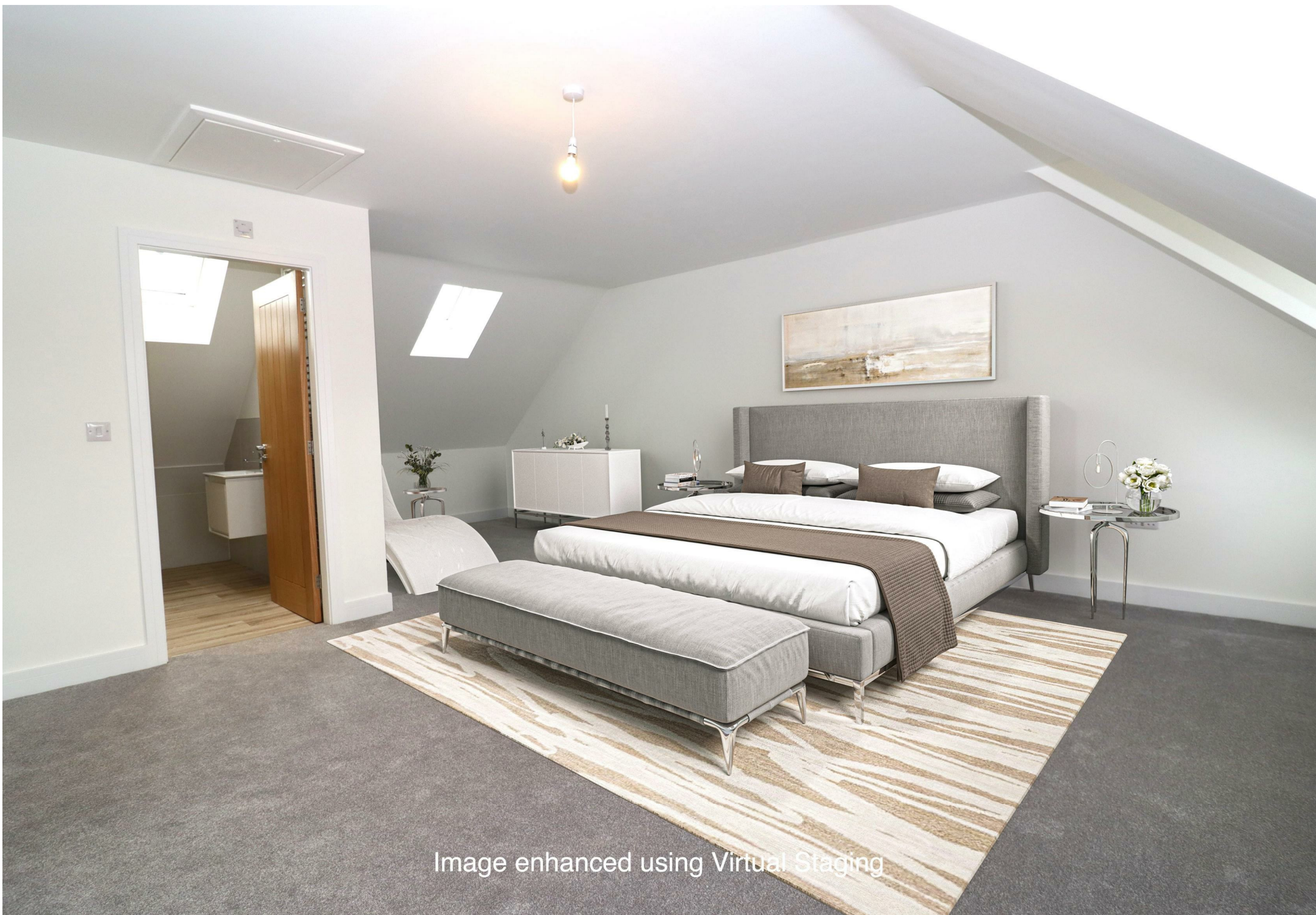
Image enhanced using Virtual Staging