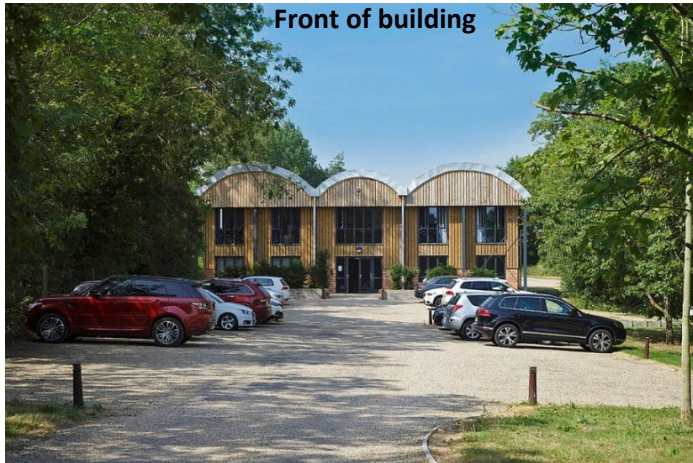
Front of building