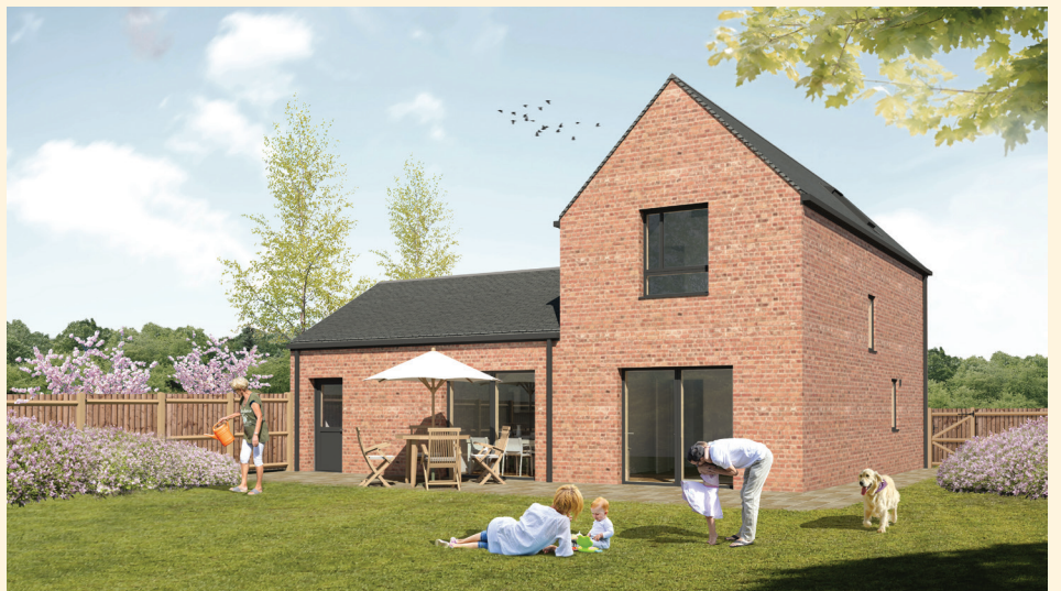
The Mews. 3 Bedrooms. Detached or Link-detached.