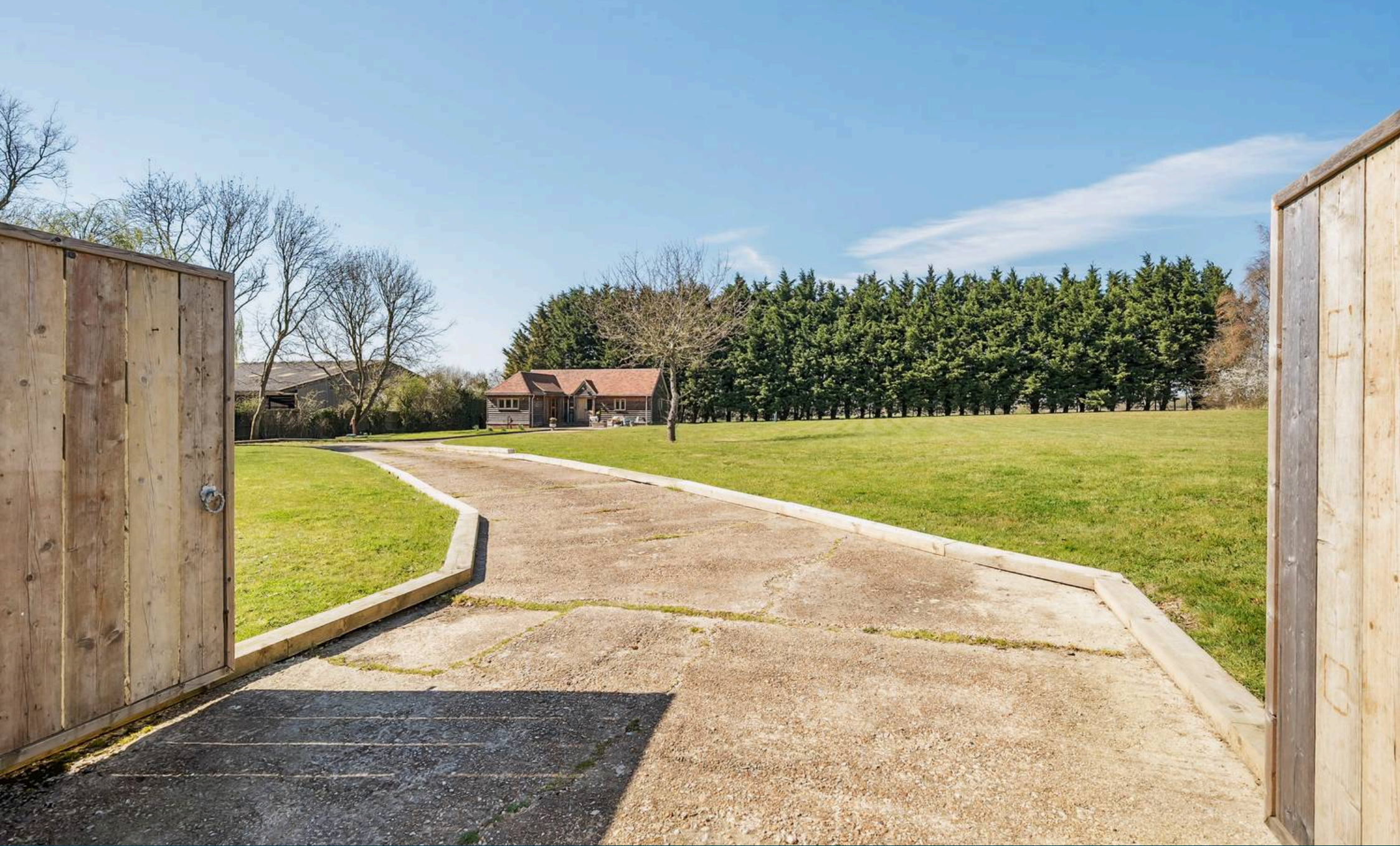
Trybairn Ham Green, Wittersham £600,000