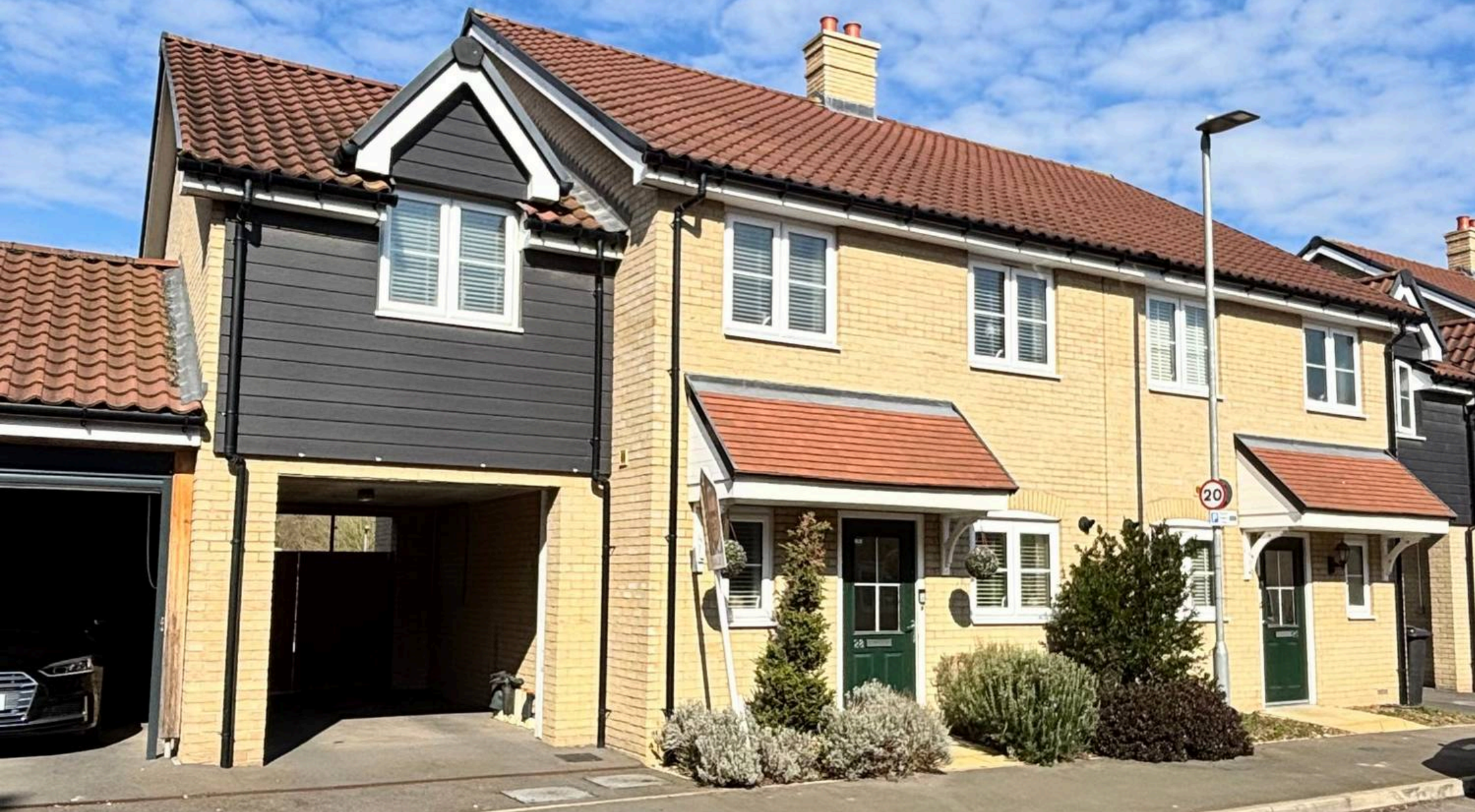
Searle Crescent, Broomfield £490,000