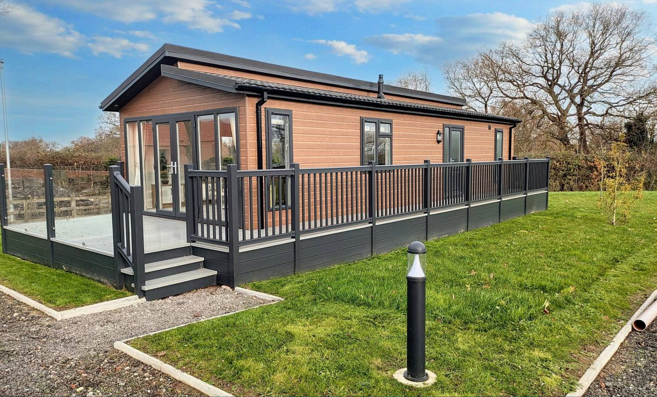
The Southwold, Berkeley Meadows Holiday Park, Egdon Lane, Worcestershire £160,000