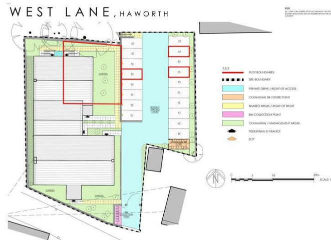
Conveyance Plan - Plot 5