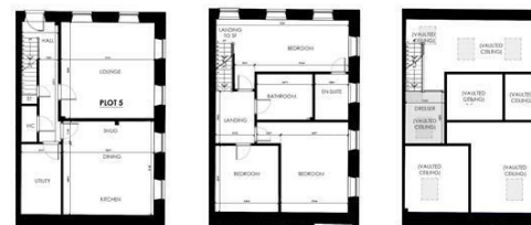
Ground Floor Plan First Floor Plan Second Floor Plan