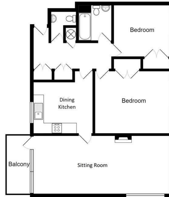
8 Wells Court

All measurements are approximate and for display purposes only. No liability is accepted by either the agency or Box Property Solutions Ltd as to the exact measurements of the rooms. Box Property Solutions Ltd retains the copyright on this plan and allows agents to use it with agreed permission.