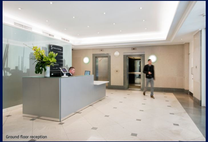
Ground floor reception

⬅ N For indicative purposes only, not to scale.