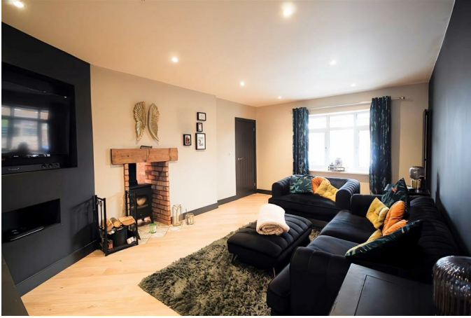
Living Room 12'3" x 19'0" ( 3.75m x 5.80m)

A spacious and inviting area with sleek dark leather sofas, a contemporary fireplace, and elegant décor, ideal for family gatherings.