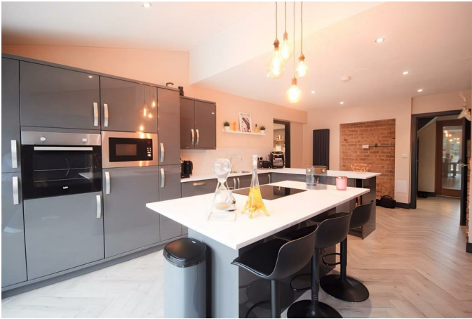
Kitchen 12'9" x 15'3" (3.90m x 4.67m)

Modern kitchen featuring state-of-the-art appliances, a large island, and stylish cabinetry, perfect for the culinary enthusiast.