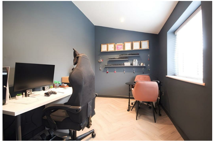
Flexible Office/Bedroom 12'0" x 9'0" (3.66m x 2.75m)

A private and adaptable space, currently set up as an office but easily convertible into a fourth bedroom, offering additional accommodation for larger families or guests.