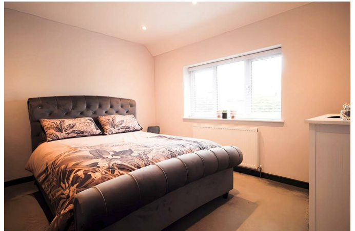
Master Bedroom 12'4" x 11'5" (3.77m x 3.49m)

A serene retreat featuring a large bed, modern furnishings, and a soothing color palette.