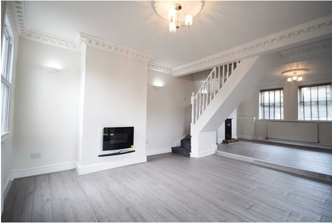
Lounge/Dining Room 13'11" x 10'9" - 13'11" x 14'4" (4.25 x 3.28 - 4.25 x 4.37 )

Spacious open-plan area with contemporary grey wood flooring and traditional white decor. Features a charming fireplace providing a focal point for both dining and relaxation.