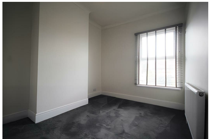
Bedroom 2 6'11" x 10'3" (2.13 x 3.14)

A cosy room ideal for children or guests, featuring light-filled windows and ample space for storage.