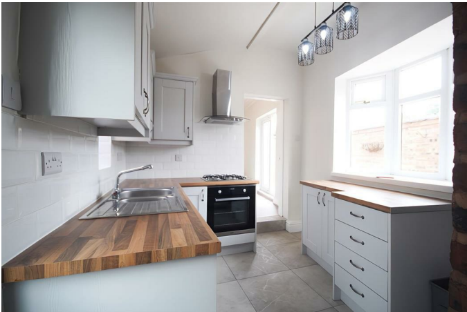
Kitchen 7'3" x 10'5" (2.23 x 3.19 )

Modern kitchen equipped with the latest appliances, white cabinetry, and a contrasting wood countertop. Includes a beautifully designed stained glass window adding a unique touch to the space.