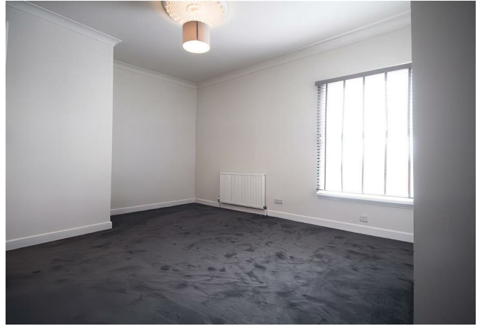
Bedroom 1 13'10" x 10'11" (4.24 x 3.33)

The largest bedroom, offering ample space for both a king-sized bed and additional furniture. Neutral decor and grey flooring create a serene atmosphere.