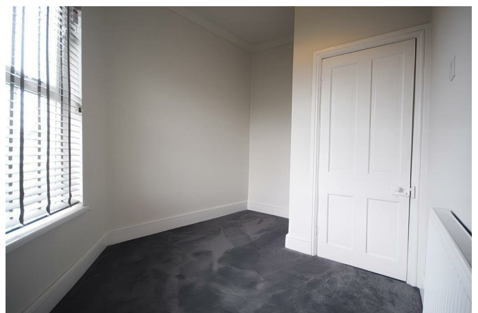
Bedroom 3 6'7" x 10'7" (2.03 x 3.24)

Bedroom 2, offering versatility as a guest room or home office, with ample natural light and space.