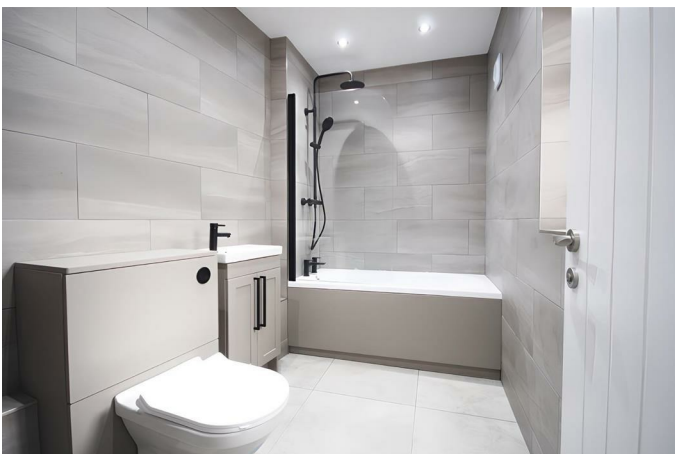
Bath Room 7'3" x 8'6" (2.22 x 2.61)

Fully equipped with modern amenities, this bathroom features sleek, contemporary tiling and