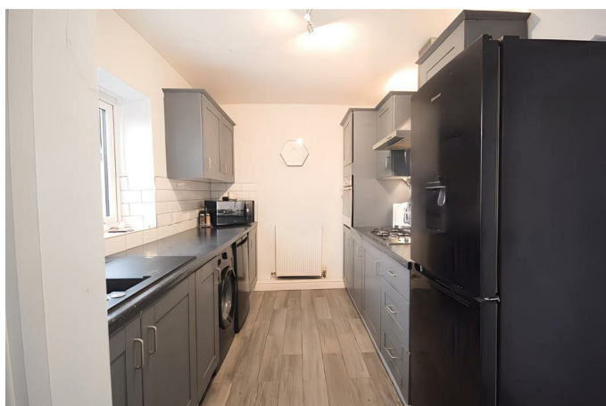
Kitchen 13'4" x 8'0" (4.08m x 2.45m)

The Modern and functional kitchen has ample storage space, space for two undercounter appliances and space for a large fridge. Also including an integrated single oven and cutting-edge gas stove, for high-performance cooking. This kitchen is a harmonious blend of form and function, promising a delightful cooking experience.