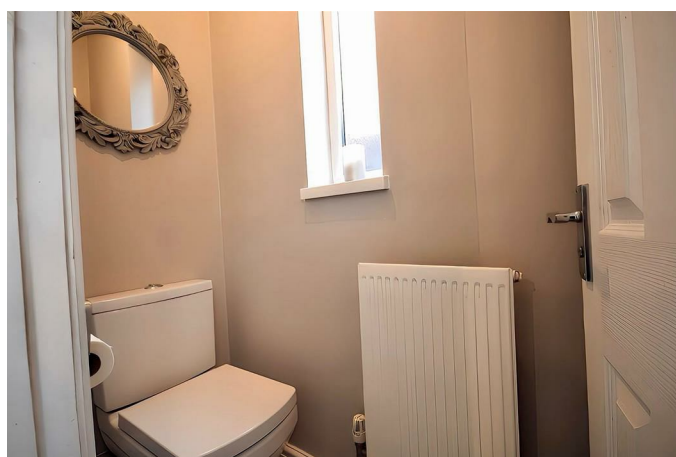
Guest W/C 2'3" x 6'3" (0.7m x 1.91m)

A guest W/C ensuring a convenient and pleasant experience for your guests. Thoughtfully located on the ground floor for accessibility.