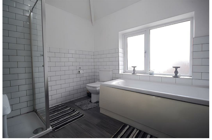
Family Bathroom 9'1" x 8'0" (2.79m x 2.45m)

The family bathroom features both a rejuvenating shower and a bathtub, catering to all your family's needs. The practical layout ensures convenience for busy mornings and tranquil evenings.