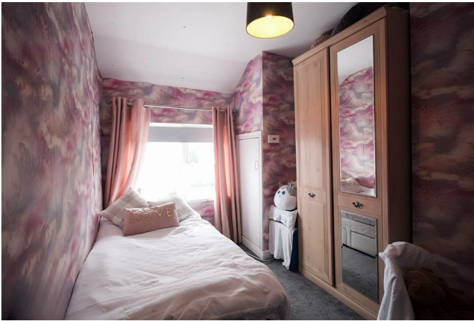
Bedroom 2 6'7" x 11'6" (2.03m x 3.52m)

Discover comfort and efficiency in this double second bedroom. Enjoy a cozy sleeping area with a storage cupboard for organization. The back view window fills the space with natural light, creating a serene ambiance for relaxation.