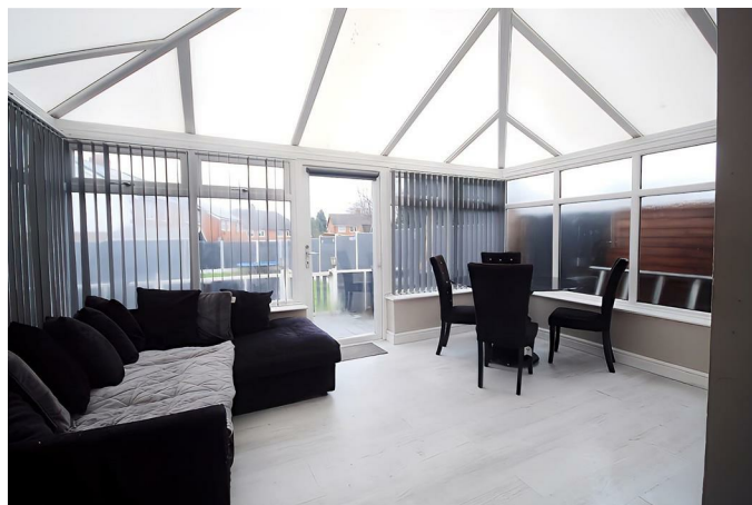
Conservatory 13'5" x 11'10" (4.10m x 3.63m)

Step into a sunlit spacious conservatory, where light floods in, creating an airy and inviting atmosphere. Designed to accommodate a generous 6/8 seater dining table for delightful meals and a lounge settee for moments of tranquil repose. A glass door connects the interior to the enchanting back garden. Whether hosting gatherings or enjoying quiet moments, this conservatory offers a perfect blend of comfort and connection with the outdoors.