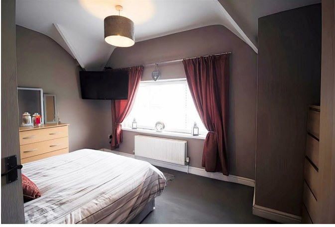
Master Bedroom 12'8" x 9'5" (3.87m x 2.88m)

A double master bedroom, where comfort and style converge seamlessly. With ample space for wardrobes, ensuring a clutter-free sanctuary. The room is bathed in natural light through the front view window, framing a picturesque scene that adds a touch of serenity to the space.