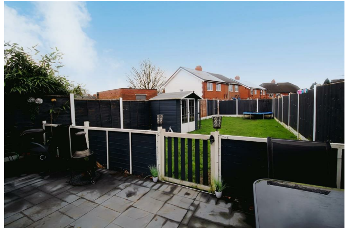
Private Back Garden

An enchanting enclosed private back garden. The paved patio welcomes you with a perfect spot for outdoor gatherings. The garden is surrounded by lush greenery, providing a serene backdrop for relaxation. Also including a wooden shed, offering convenient storage for gardening tools or creating a cozy retreat and an access gate to the front of the property. .