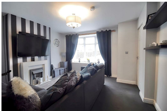
Living Room 16'1" x 12'11" (4.92m x 3.95m)

Discover the perfect blend of warmth and elegance in this inviting lounge with an electric fireplace, nestled beneath a tastefully crafted mantel, while a graceful bay window frames a captivating front view. An ideal space for relaxation and enjoyment for the whole family.