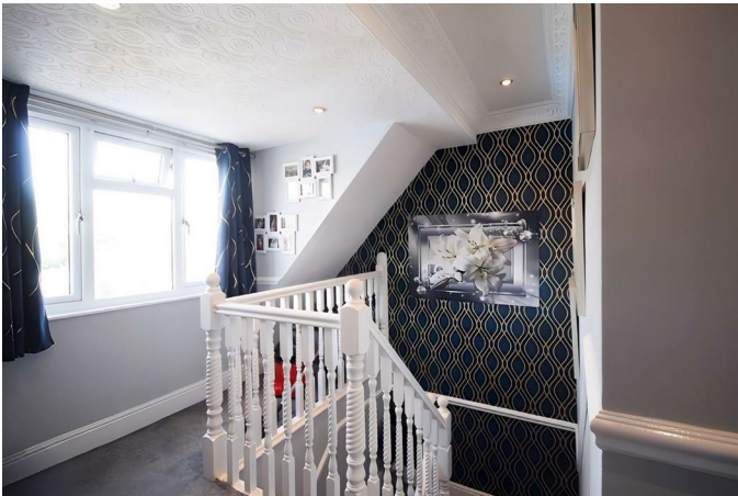
1st Floor Landing Area 10'5" x 16'7" (3.19m x 5.06m)

The landing area on the first floor of the property presents a unique opportunity to craft a personalized study or office space within the comfort of your home. Bathed in natural light filtering through the front facing windows, the airy atmosphere provides an ideal backdrop for concentration and creativity. With ample room for a desk, shelves, and seating.