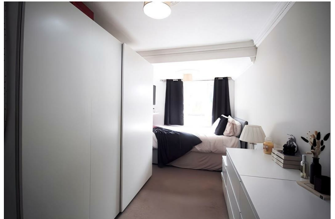
Bedroom 2 7'8" x 15'8" (2.35m x 4.80m)

Bedroom 2 presents a cozy and inviting space with natural light filtering through the double glazed window facing the rear garden, illuminating the room with a gentle ambiance.