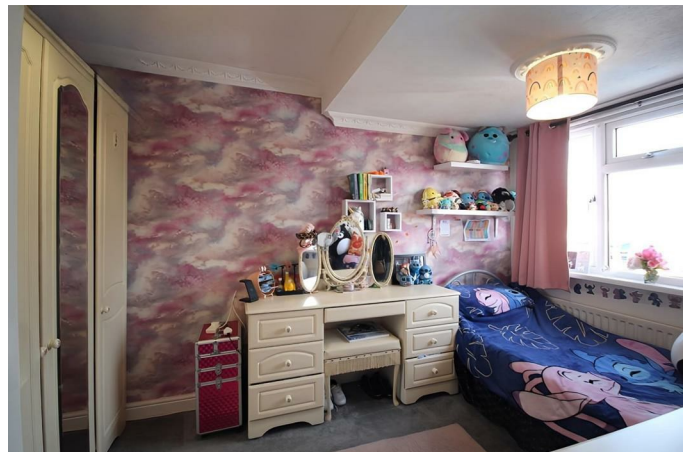
Bedroom 3 7'8" x 12'5" (2.36m x 3.81m)

Bedroom 3 with its front-facing view, is flooded with