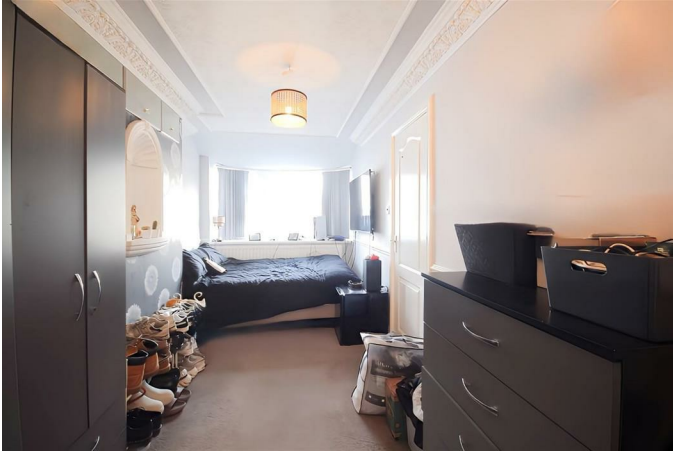
Bedroom 4 / Living area 7'8" x 12'5" (2.36m x 3.81m)

Transformed from a single garage into a versatile living space, this stylish conversion offers the flexibility of a fourth double bedroom or an additional lounge/dining area, tailored to suit your lifestyle needs.