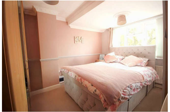
Bedroom 1 10'5" x 11'7" (3.18m x 3.54m)

Natural light streams into the Master Bedroom through the double glazed window facing the back garden, creating a bright and airy atmosphere. With its tranquil ambiance and practical features, this master bedroom provides a perfect haven for rest and relaxation.