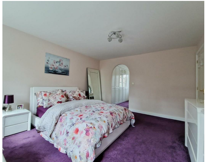
Master Bedroom with Ensuite Shower Room 13'6" x 11'8" (4.14m x 3.58m)

The master bedroom is meticulously designed to offer both comfort and elegance. Adjoining the sleeping quarters is a spacious dressing area, complete with ample storage solutions ensuring organization and convenience. The ensuite bathroom has tasteful finishes. Front view windows overlook the serene canal, allowing natural light to flood the room and providing picturesque views.