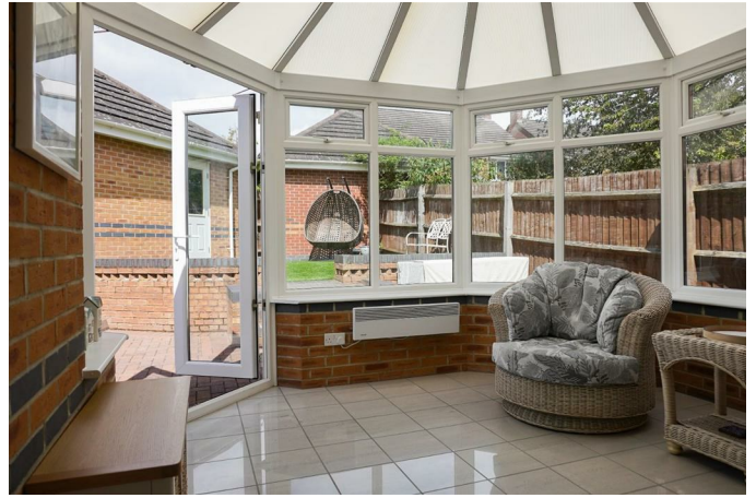
Conservatory 13'3" x 11'1" (4.04m x 3.38m)

The conservatory stands as an inviting extension to the home, offering an additional living space that seamlessly integrates with the surrounding landscape. Its glass windows bathe the interior in natural light, creating a bright and airy atmosphere that feels connected to the outdoors.