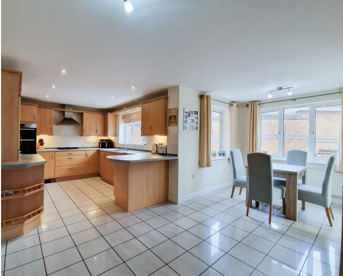
Kitchen /Breakfast Room 21'7" x 17'4" (6.6m x 5.29m)

The kitchen with breakfast/dining area is both functional and stylish. The gas stove and double oven provide the tools for culinary creativity, while ample cupboards and storage space ensure organization and efficiency. With expansive work areas, meal preparation becomes a joy, whether cooking for family or entertaining guests.