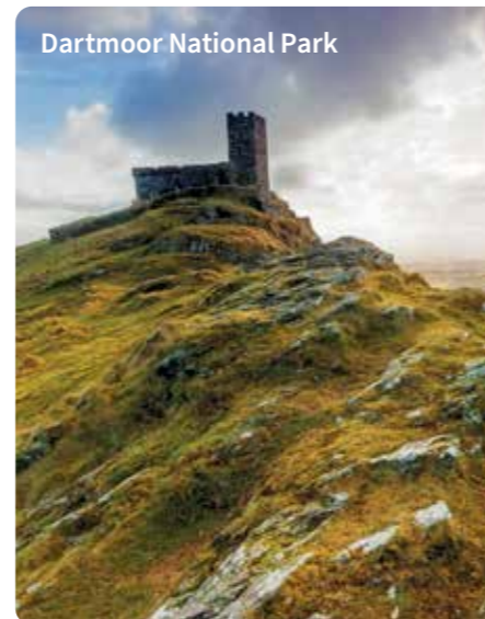
Dartmoor National Park

Or, why not visit Powderham Castle? Over 600 years of history can be discovered within the walls and you can enjoy unique guided tours with haunted landings and secret doors bringing history to life!