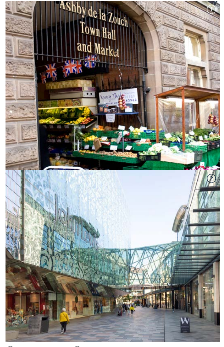
1 \hookrightarrow Ashby town centre 2 \hookrightarrow Highcross, Leicester

Enjoy a day of retail therapy at the hundreds of familiar name stores on offer at the Highcross and Haymarket shopping centres, or lose yourself in The Lanes, with its characterful and eclectic range of independent boutiques and rich array of eateries.