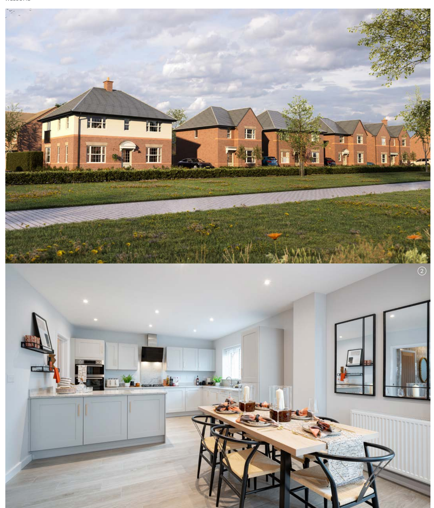
\bigcirc Artists impression of Ashby Fields