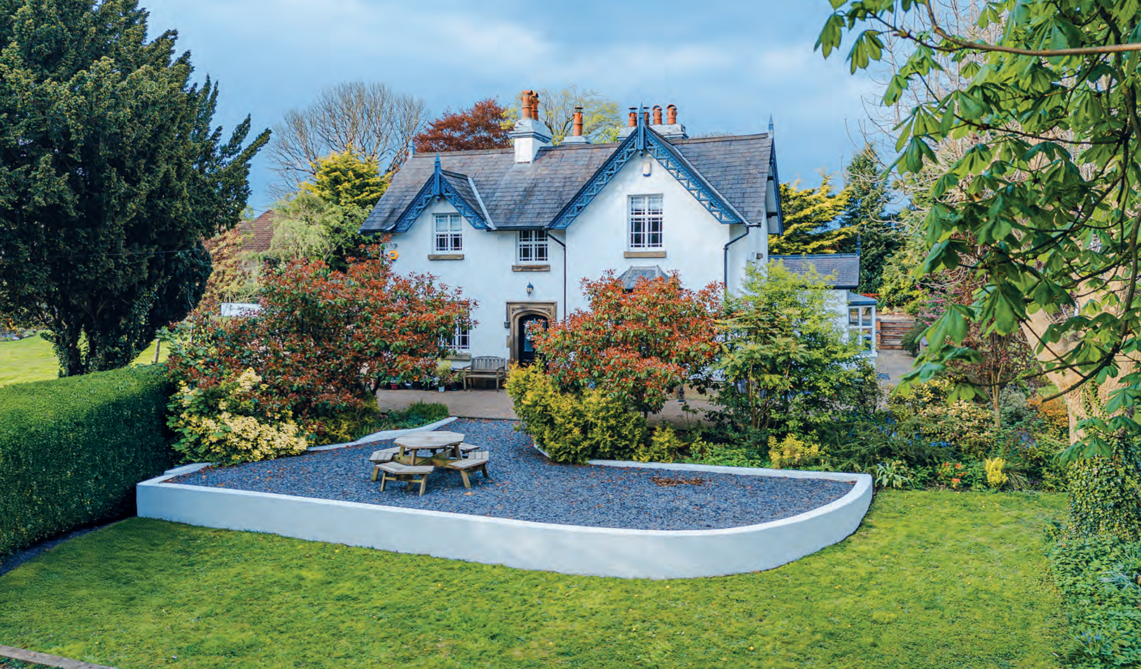
White House Wrexham Road | Mold | CH7 1HT