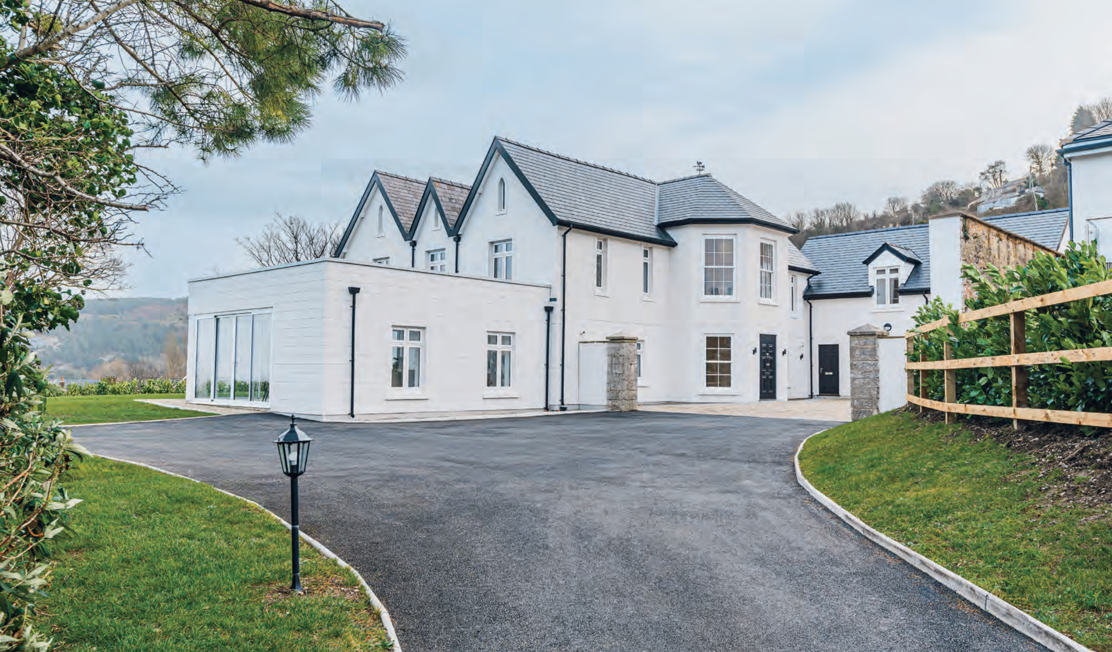
Tan Yr Allt Hall Abergele Road | Llanddulas | Abergele | Conwy | LL22 8HR