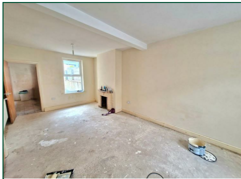
GROUND FLOOR 452 sq. ft. (42.0 sq.m.) approx.