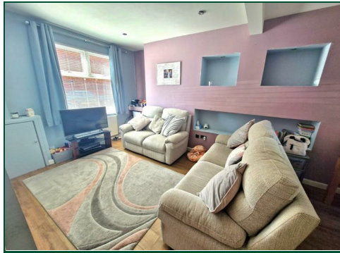
GROUND FLOOR 468 sq. ft. (43.5 sq.m.) approx.