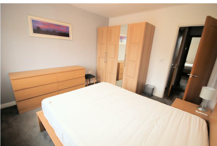
View of Bedroom 1