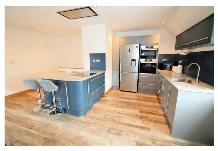
View of Living/Dining/Kitchen Room