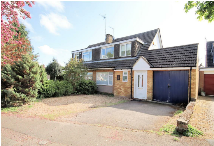
Frontage & Drive

Front Drive and gravel frontage with off road parking for 2/3 vehicles, mature shrubs.