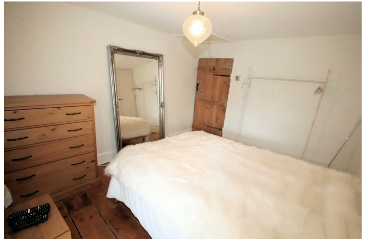
View of Bedroom 1

Replacement uPVC triple glazed window to front, two built-in double wardrobes, double radiator, exposed wooden flooring, TV point(s), double power point(s), access to loft space.