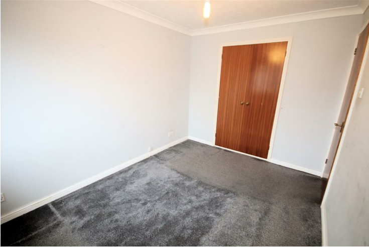
View of Bedroom 1

Sealed unit double glazed window, built-in double wardrobe(s), single radiator, fitted carpet, double power point(s), coving to textured ceiling.