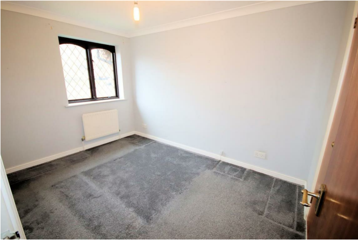
Bedroom 1 11'6" x 8'8" (3.50 x 2.64)

Sealed unit double glazed window, built-in double wardrobe(s), single radiator, fitted carpet, double power point(s), coving to textured ceiling.