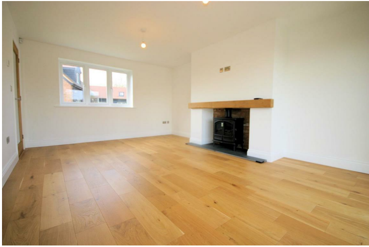
View of Living Room

Dining Area: UPVC double glazed extended height multi-paned window to rear, ceramic tiled underfloor heating, TV point, double power point(s), recessed ceiling spotlights, tri-fold door leading through to the living room, double glazed doors to entrance hall.