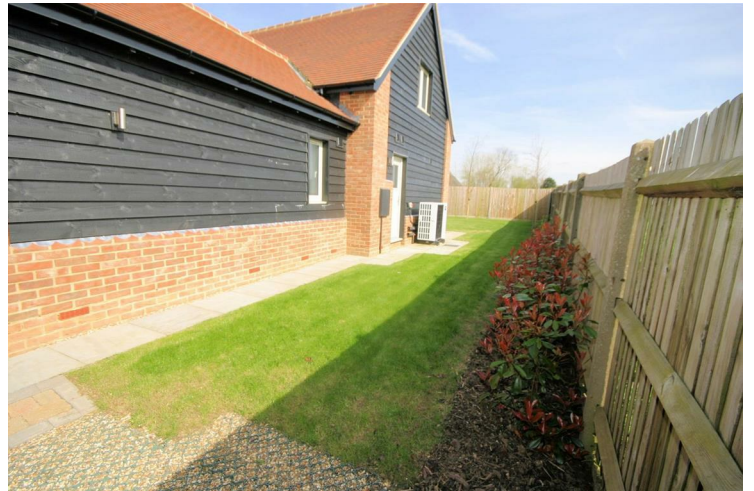
View of Front of Development