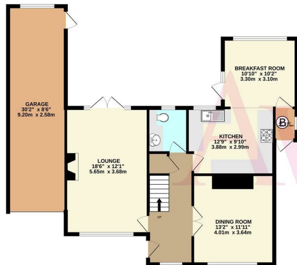
GROUND FLOOR 1012 sq.ft. (94.0 sq.m.) approx.