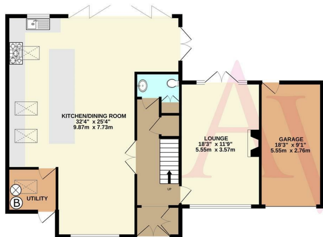
GROUND FLOOR 1166 sq.ft. (108.4 sq.m.) approx.