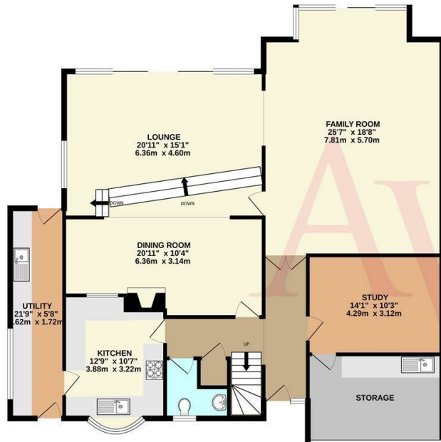
GROUND FLOOR 1663 sq.ft. (154.5 sq.m.) approx.